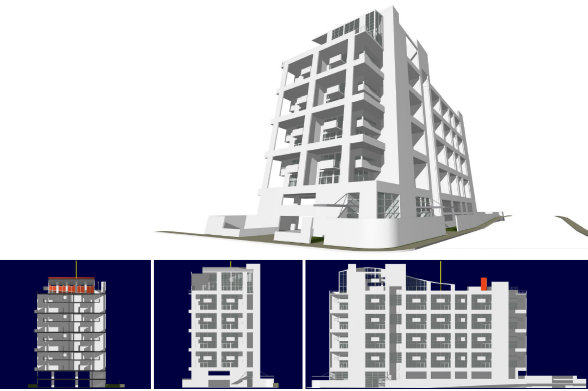
Alberto J. Otero, Architect (2000- present)

Brickell Station Villas, $14 million, completed in 2008