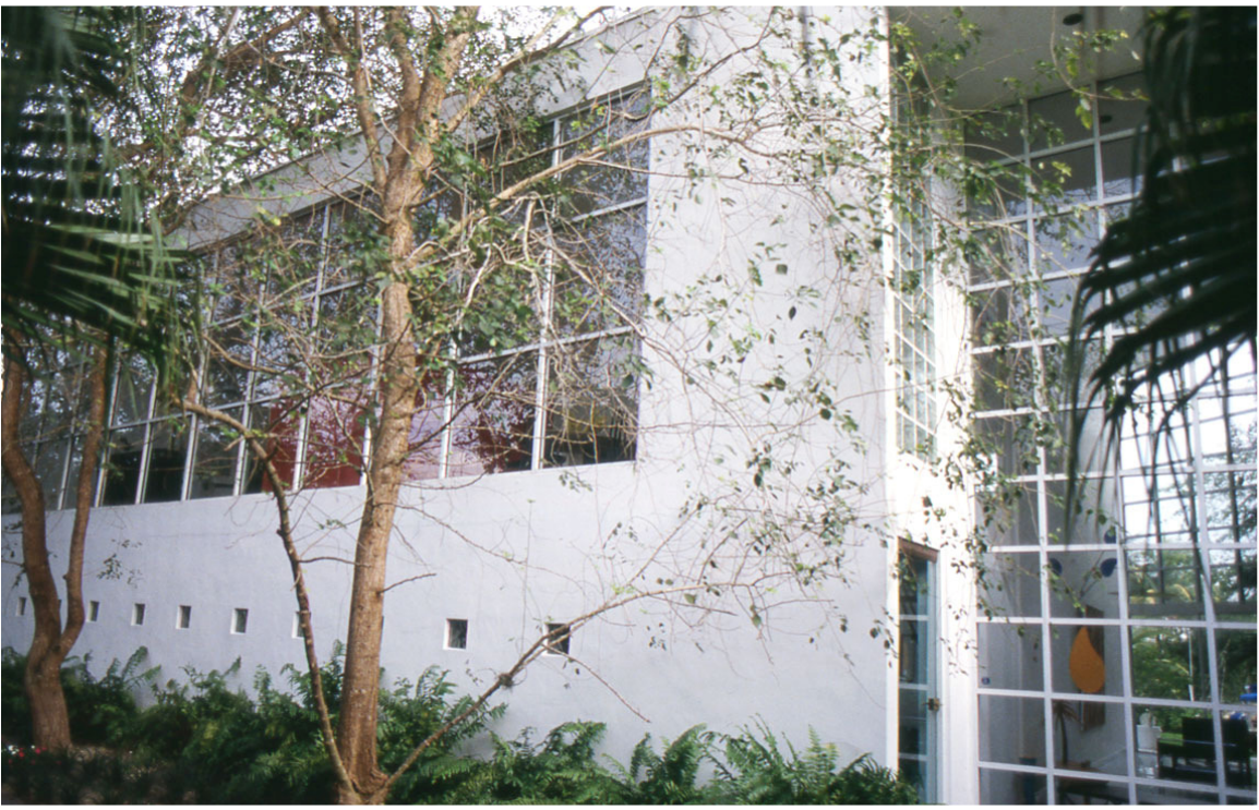
Bared house, Florida Home and Garden, Playboy, Miami Vice