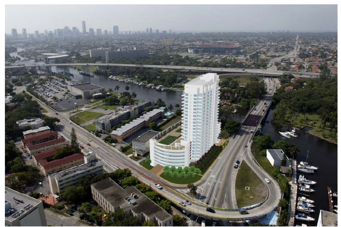
1690 NW N River Drive, $40 million budget, cd s completed