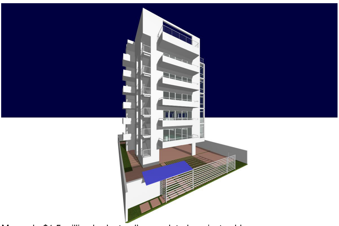
Monarch, $1.5 million budget, cd's completed, project sold

Brickell Station Villas, $14 million, completed in 2008