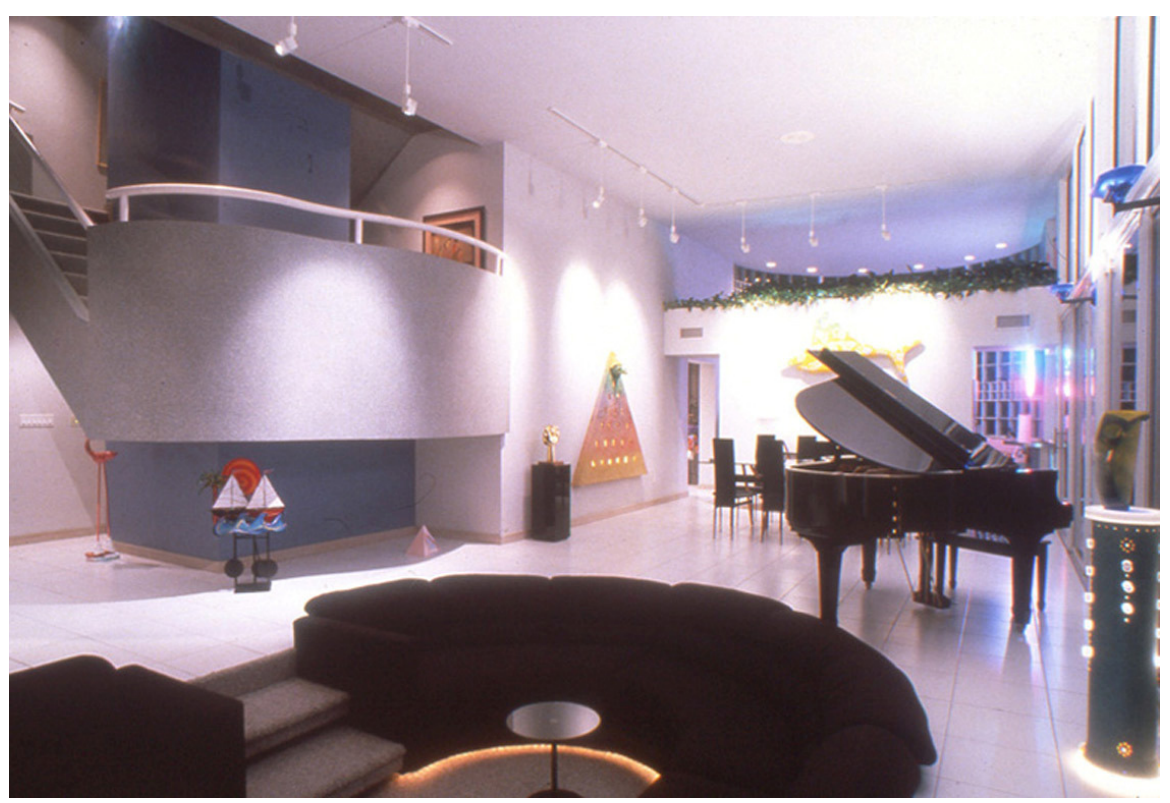
Weitz house, Florida Home and Garden, Ambiente, TV movie