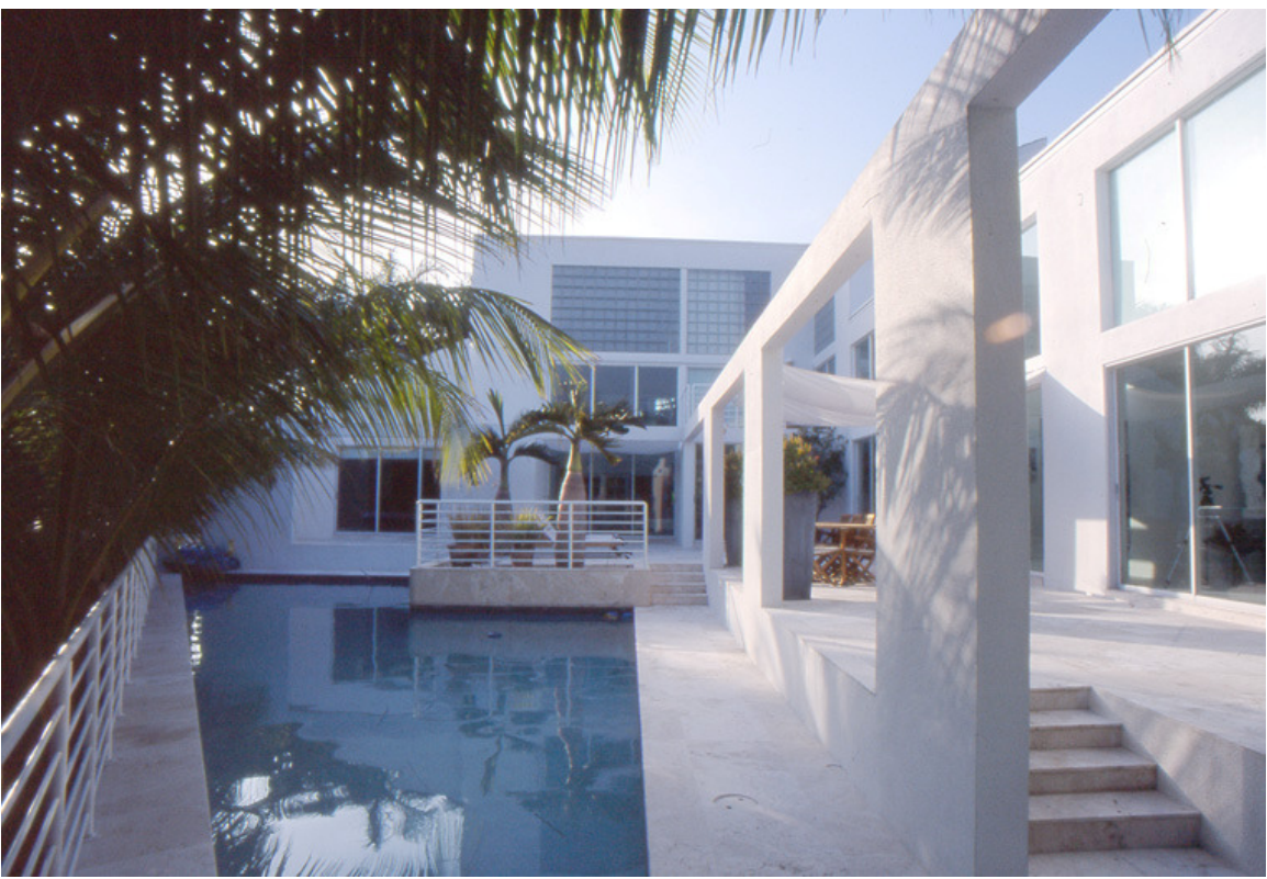
Van de Put house, Architectural Digest