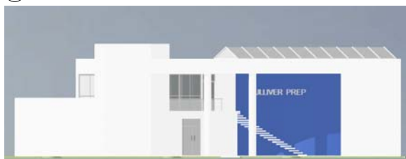
○ SOUTH ELEVATION